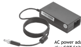
AC power adapter (for GOT-5120T-830-J)

Touch Panel Computers for Various Industry Applications